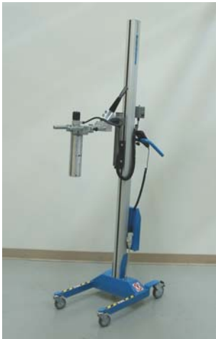
EXPAND-O-TURN® 120E Series-Maximum Weight 60-lbs 200E Series-Maximum Weight 150-lbs