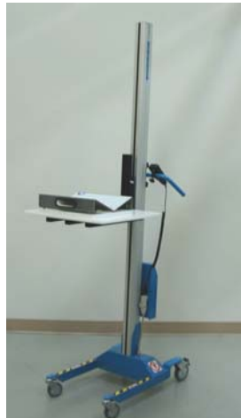
Platform with "V" Block and Turntable 120V Series-Maximum Weight 90-lbs 200V Series-Maximum Weight 180-lbs

The LIFT-N-GO™120/200 series lifters provide an economical, safe, efficient, and ergonomic material handling solution to assist you with your production needs.