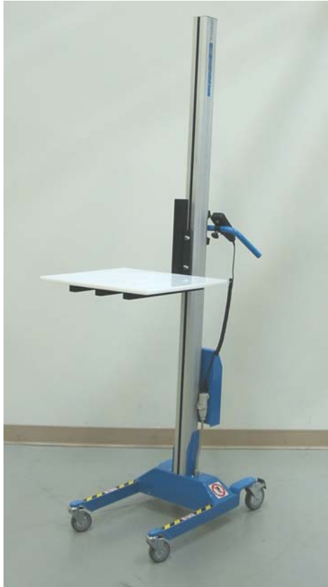
Platform 120S Series-Maximum Weight 120-lbs 200S Series-Maximum Weight 200-lbs